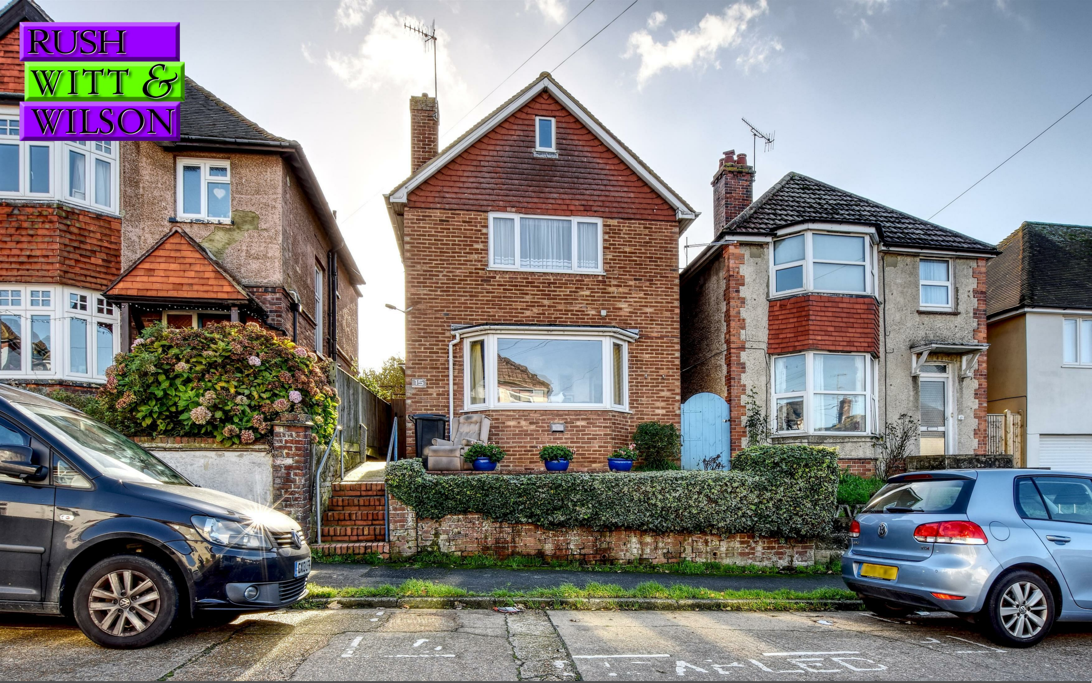
15 Sedgewick Road, Bexhill-On-Sea, East Sussex TN40 2DA £315,000